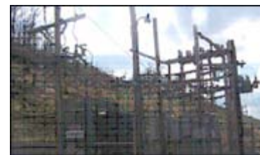
Electric utility substation

Federal Bureau of Investigation Intelligence Assessment (Unclassified) Prepared by FBI Criminal Intelligence Section September 15, 2008